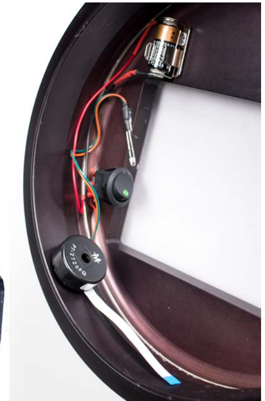
Rear water alarm (audible/visual)