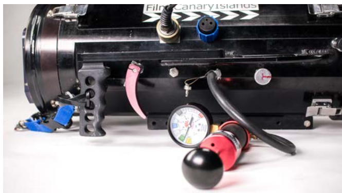
Pressurised seal check system