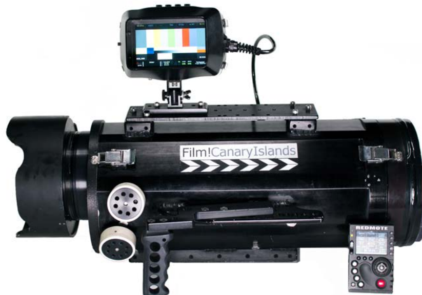
REDMOTE connects through the housing at the surface