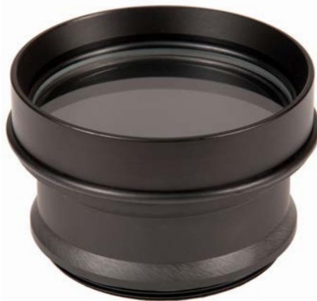
Flat port for Macro/Close-up photography